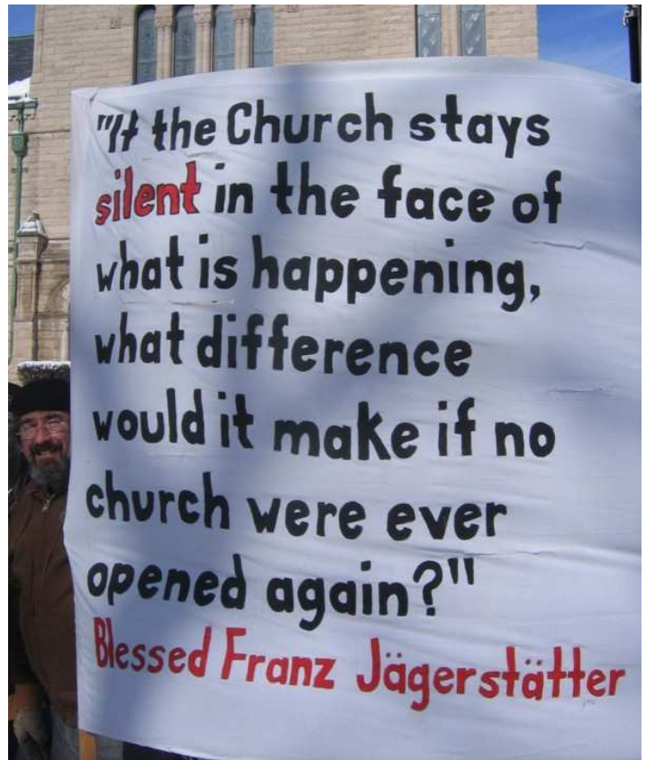
Banner displayed during Lent of 2008 at the vigil by the Cathedral in Des Moines, IA.

When the Nazis rolled into Austria, Franz Jägerstätter began to voice his opposition to the regime. He reported for military training in 1941 but was able to return after his village petitioned for his release because of his value back home. He had apparently come to new awareness during the training stint. Upon returning he declared that he would not resume military service because Germany was fighting "an unjust war."